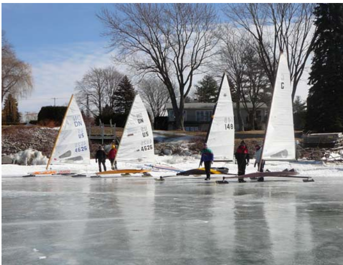
An Ice Day For a Sail at PIYC (Powlison Ice Yacht Club)! Doug Merrill